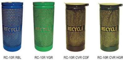
RC-10R RBL RC-10R YGR RC-10R CVR COF RC-10R CVR HGR