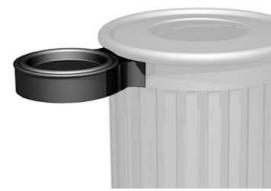
Ash tray side mount