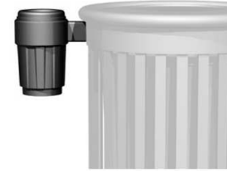
Ash receptacle side