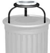
Dome ash lid