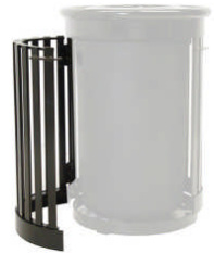
Side Opening Door

Some of the most popular options available with this unit