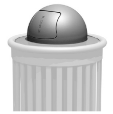
Dome top w/door