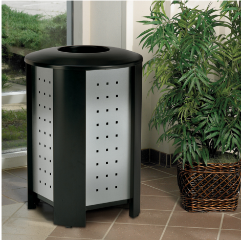
Frames & Tops available in Black or Silver