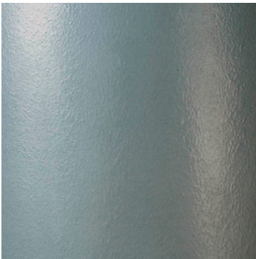
Textured Aluminum Stock Color