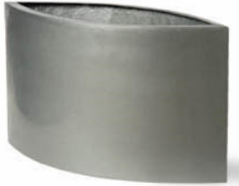
Textured Aluminum Finish