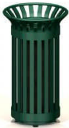
Matching Ash Urns