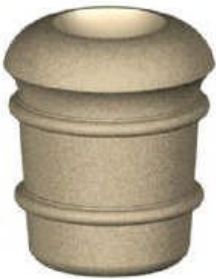
Matching Ash Urn