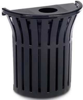
Half Round is Wall Mounted for maximum space savings