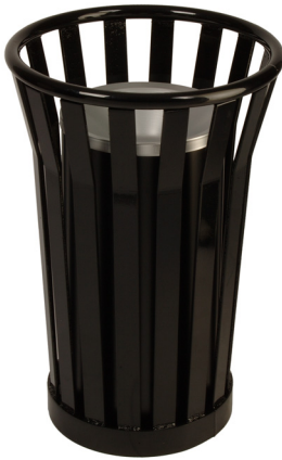
Available ash urns