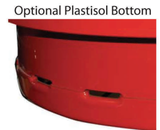
Optional Plastisol Bottom