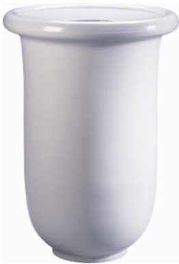
Matching Waste Receptacles