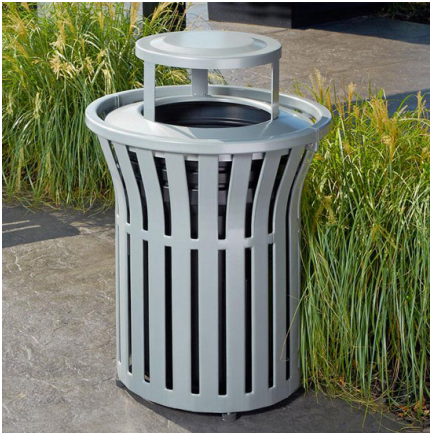
Coordinates beautifully with the South Hampton Waste Receptacle with Bonnett