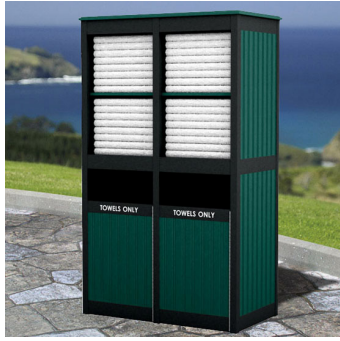
Matching Planters, Towel Valents and benches Available