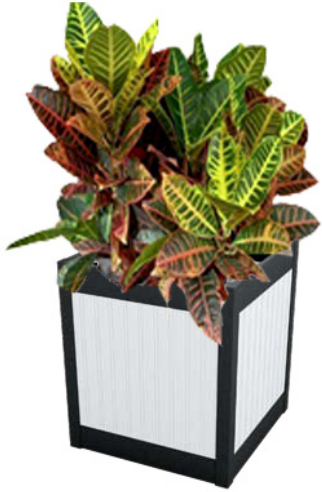
Matching Planters Available